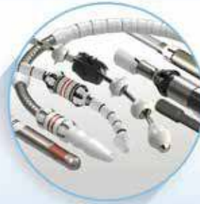
PROBES & WEDGES