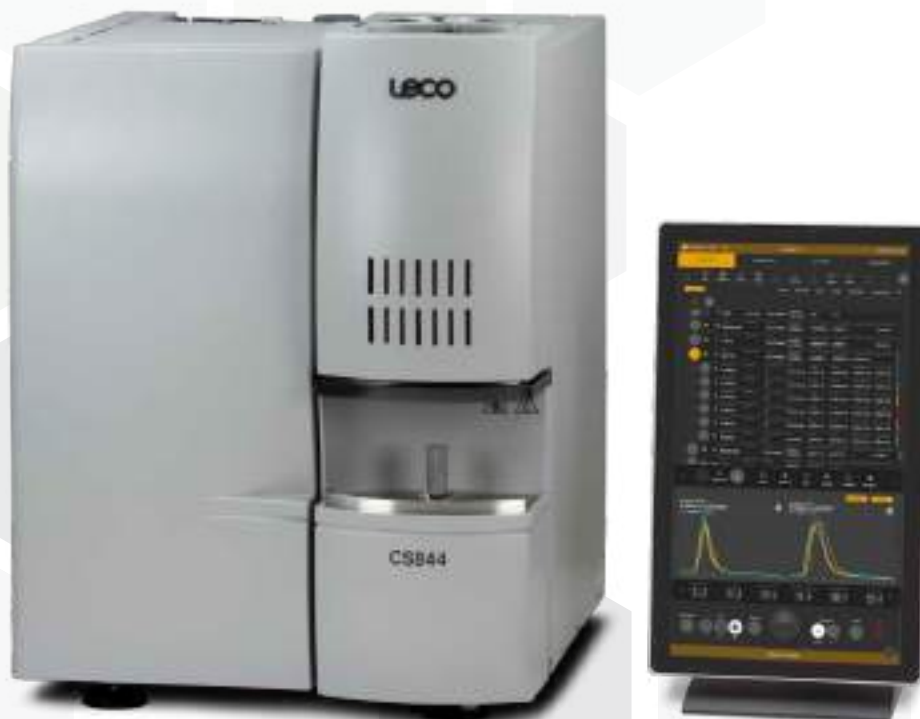
Shown with stand-alone touch-screen monitor.