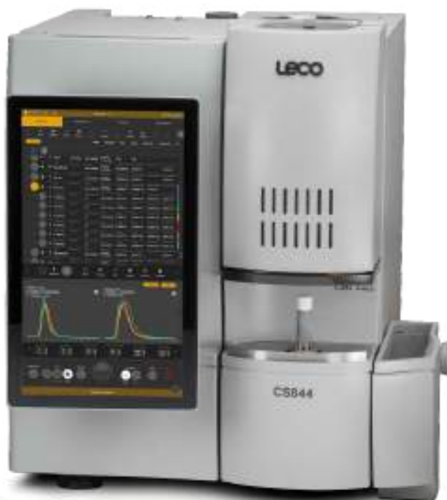
Shown with touch-screen monitor.