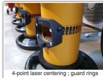
4-point laser centering ; guard rings